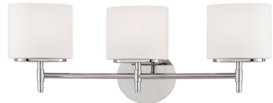
Trinity Collection (U3E3) 3-Light Bath Light in Polished Chrome Finish with Matte-Finished Opal Glass Shades. Special Price: $320 00

Transform your bathroom lighting to create a warm, spa-like refuge.