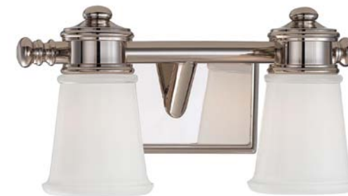
Transitional Bath Art (RYJH) 2-Light Bath Light in Polished Nickel Finish with Clear Glass Shades with Interior Etched White Finish. Special Price: $119 90