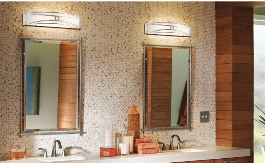
a. Duchess Collection (3RD7) - 3 light bath light in palladian bronze finish and champagne marble glass.